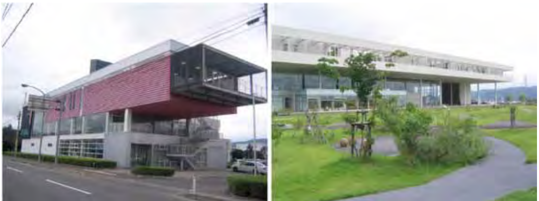
Figure 4: Shiroishi Mediapolis projects-Athens multimedia centre (1998) by Hajime Yatsuka and Katta General Hospital (2003) by Hideto Horiike, Taro Ashihara and Koh Kitayama (source: author)