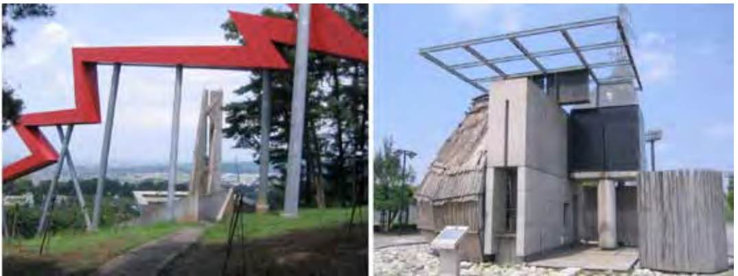
Figure 2: Machi-no-Kao projects- Uozu Observatory (1997) by Daniel Libeskind and Oshima Divided House (1993) by Benson + Forsyth with GA Kaihatsu Kenkyusho.

The resulting Machi-no-Kao projects emerged from evolving community meetings, consultation with the program coordinators, and dialogues with the nominated international architects. The majority of projects were small follies that incorporated local scenery, materials, or customs developed through exchanges between local architects and foreign architects,