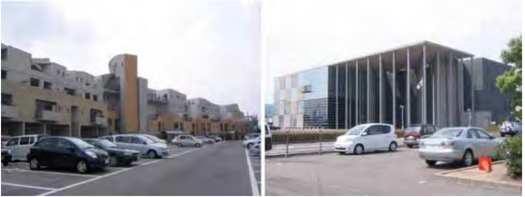
Figure 3: CTO projects- Nakasho Housing Phase II (1996) by Tsutomu Abe and Sekkei Gijutsu Center and Okayama West Police Station (1996) by Arata Isozaki and Osamu Kuramori