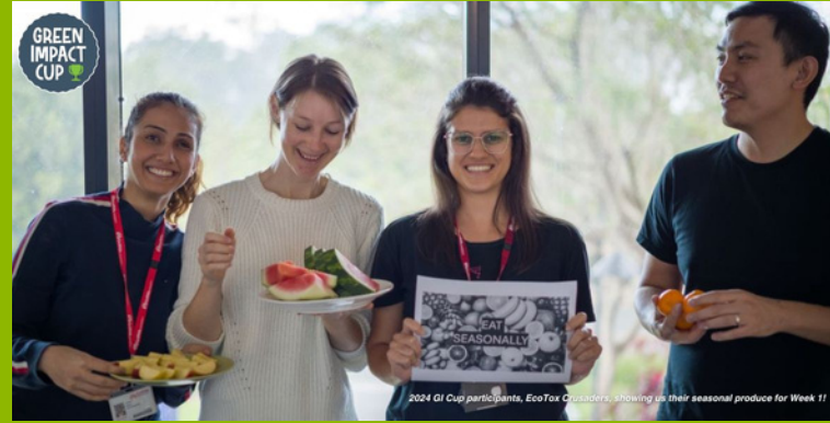
2024 GI Cup participants, EcoTox Crusaders, showing us their seasonal produce for Week 1!